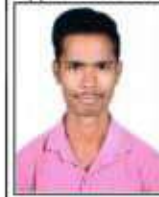
NEET Admit Card Photo